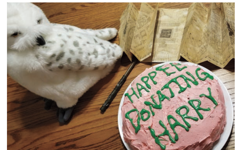
We solemnly swear that, in raising funds for student scholarships, we were up to something truly good.